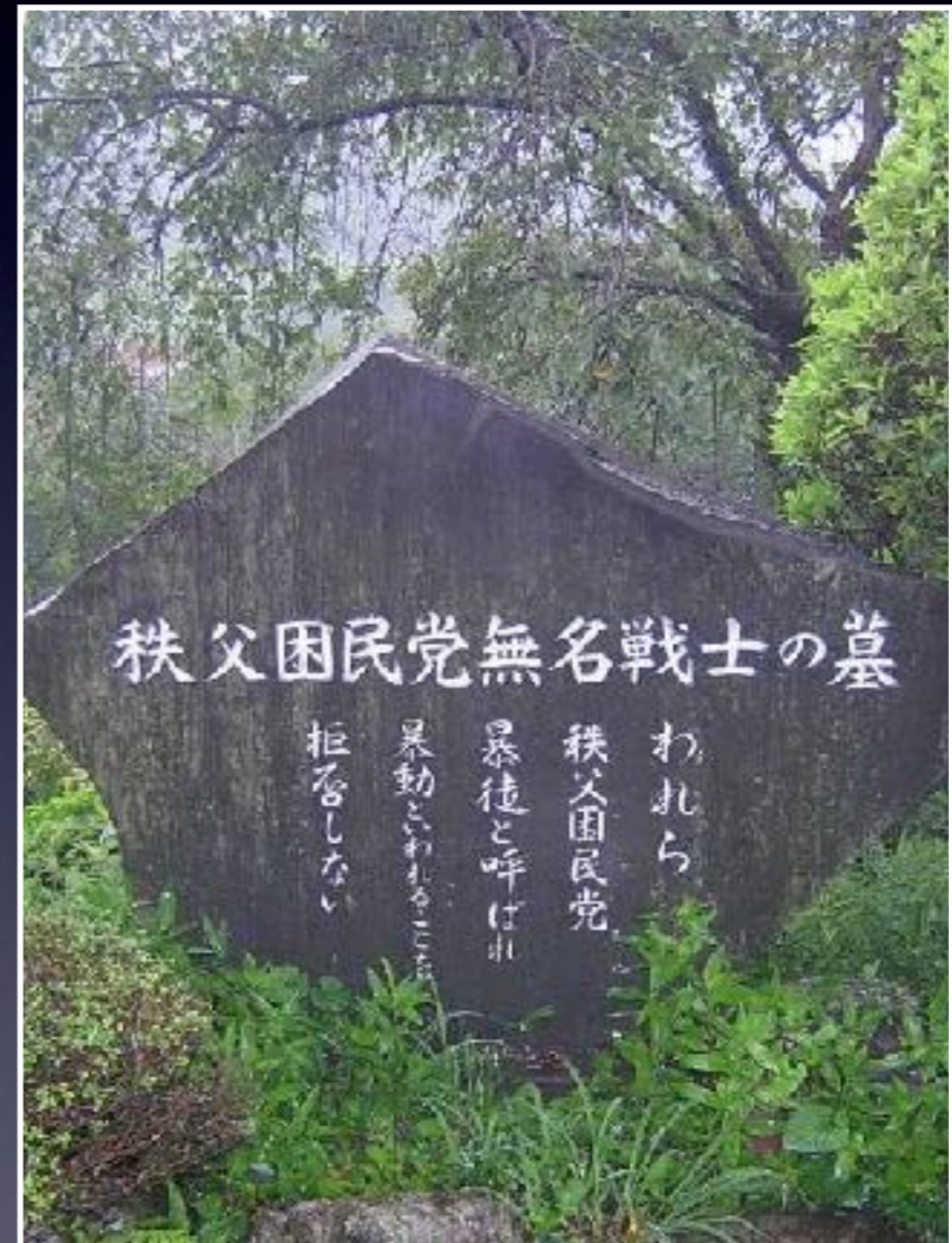
“Unknown konminto soldiers” memorial